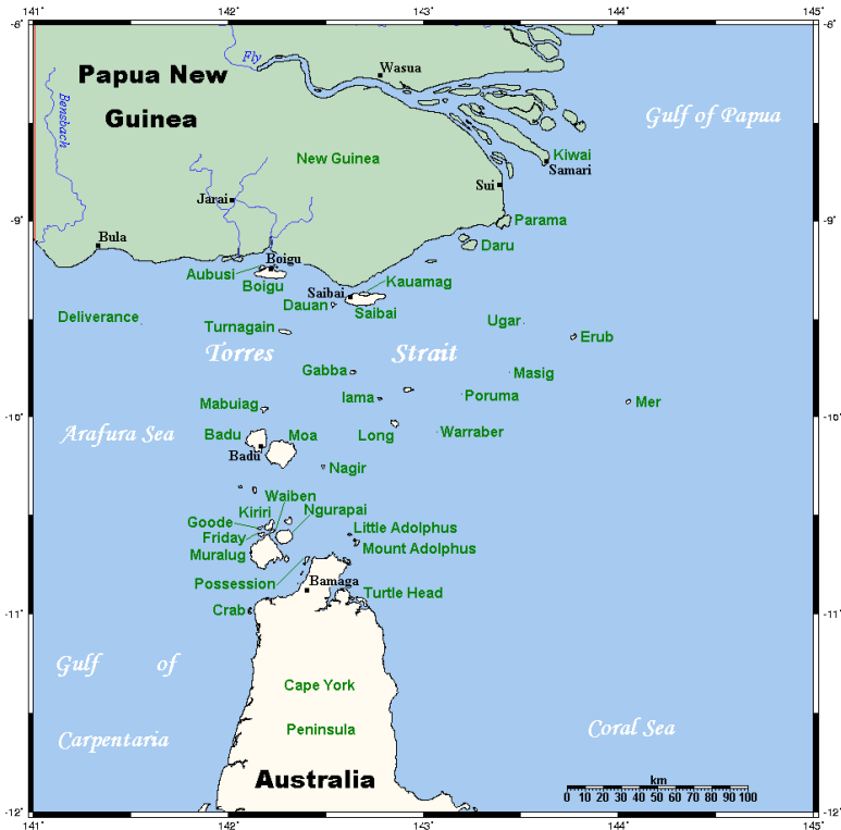
Figure 1: Torres Strait Islands situated between Papua New Guinea and Australia

Wara in kedha, gimal 85% Torres Straitalgal Australiaw dhawdhaynu nipa. Saibailgal koeyma Cairnsenu a wara Townsvillanu nipa. Dhuray Brisbaneninu. Saibaigal Saibainu, Bamaganu, Seisianu a Australiaw dhawdhaynu thana yapa ridhpoelaypa moegaw gasampa.