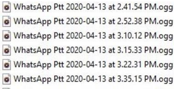
Figure 1. Screenshot of filenames download from WhatsApp

Such file names make it easy to recover later the order in which messages were received. They can either be saved and archived individually, or concatenated into a single file for the work session, using Praat or Audacity . Another benefit of using the desktop or web version of the app during the elicitation session is that it is easier to type notes using the computer keyboard than the phone keyboard. If only audio messages are being exchanged, this is less an issue. The desktop, web, and mobile versions of the app synchronise with one another, so material gathered using the mobile version can also be accessed through the desktop app.