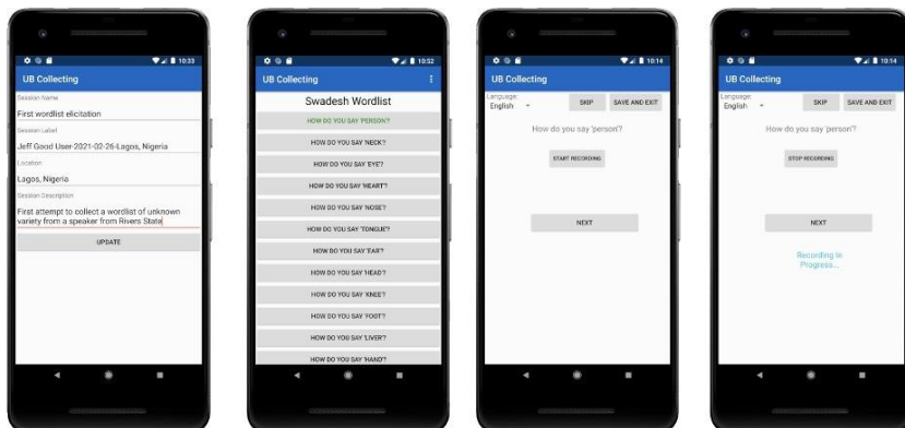
Figure 3: Illustration of workflow using the app under development

A purpose-built tool such as this has some clear advantages over general purpose tools insofar as it can produce data that is structured in ways that facilitate further annotation, analysis, and archiving. It is particularly well suited for contexts where local linguists with some training in language documentation (including students and trained community members) are in a position to do fieldwork in their home countries but may lack the technology and training needed to produce well-structured documentary corpora on their own. A disadvantage of such tools is that they cannot be readily employed by community members, and making the resources created using them available to community members would require extra steps. Future research on remote fieldwork can hopefully allow documentary linguists to better understand how to balance the potential of specifically-designed apps against the wider accessibility associated with using general purpose tools.