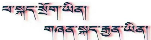
Figure 3: The text in this meme states, ‘The father tongue is the essence; others’ language is an adornment’.

A special relationship to Tibetan identity is also asserted, with the Tibetan language referred to as the soul, or essence of the Tibetan people, typically using the terms bla , bla srog , or tsho srog . For example, Rin chen rdo rje describes the language as mi rigs kyi bla srog ‘the essence of the nation’, 13 and Chos ’phel, calls it his nga ’i tsho srog gi nying po ‘soul’s heart’. 14 Beyond these pop songs, this idea of the Tibetan language as the soul of the nation is often circulated in memes, which not only assert this essentialist relationship, but also often contrast it with ‘others’ languages’ as ‘adornments’ rather than vital essence (see Figure 3).