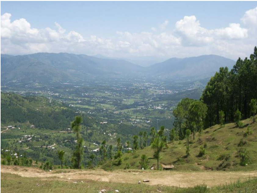
Figure 3. An overview of the Mankiyali-speaking area in Mansehra, Khyber Pakhtunkhwa, Pakistan.