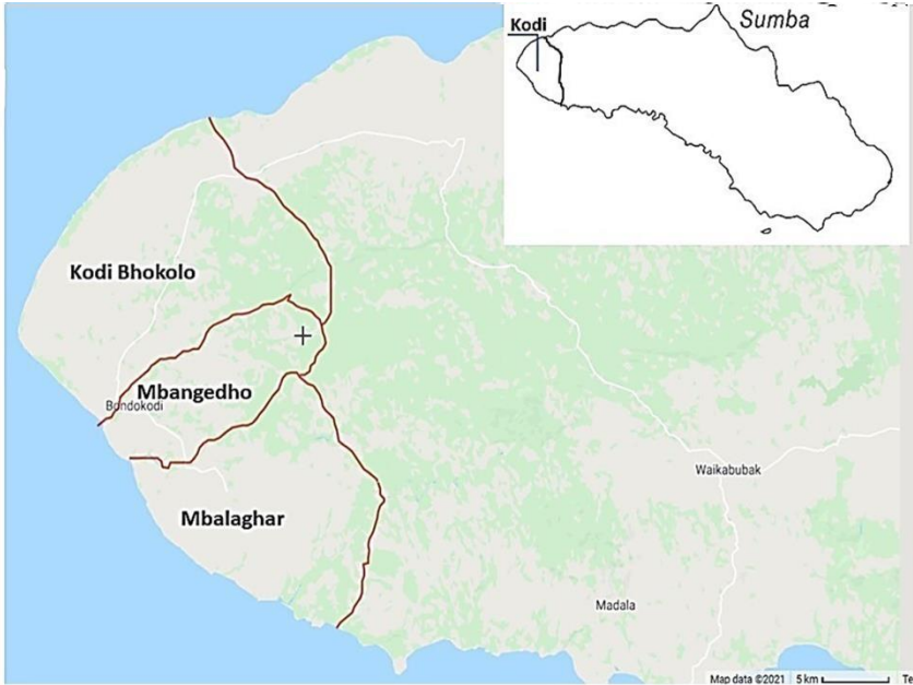
Figure 1. Kodi Bhokolo, Mbangedho, Mbalaghar locations 3

Kodi society is primarily made up of subsistence farmers who use the land in three ways: ‘as garden ( mango ), as fallow plots ( ramma ), and as pastures for livestock ( marada )’ (Hoskin 1993: 6). To meet their daily food needs, Kodi people plant rice and corn in their mango , which is mixed with beans, tubers, chillies, and vegetables. Nowadays to fulfil secondary needs (e.g., education), they mostly cultivate cashew trees for their profitable and abundant nuts. 4 In addition to supplying their food source, farming also fulfils a crucial social function of being a prestige component of the economy (Hoskin 1993). In this sense, the prestige economy relates to the social and economic currency of raising herds of buffalo, horses, and cattle in Kodi society. Other common livestock includes chickens and pigs. This livestock is also raised for sacrifice in Marapu ritualised events 5 such as paholong , woleka ‘ceremony feast’, and