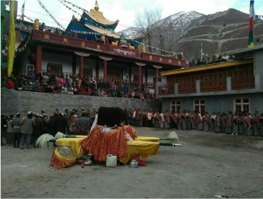
Figure 3. Local deity, and the Buddhist temple in the background.