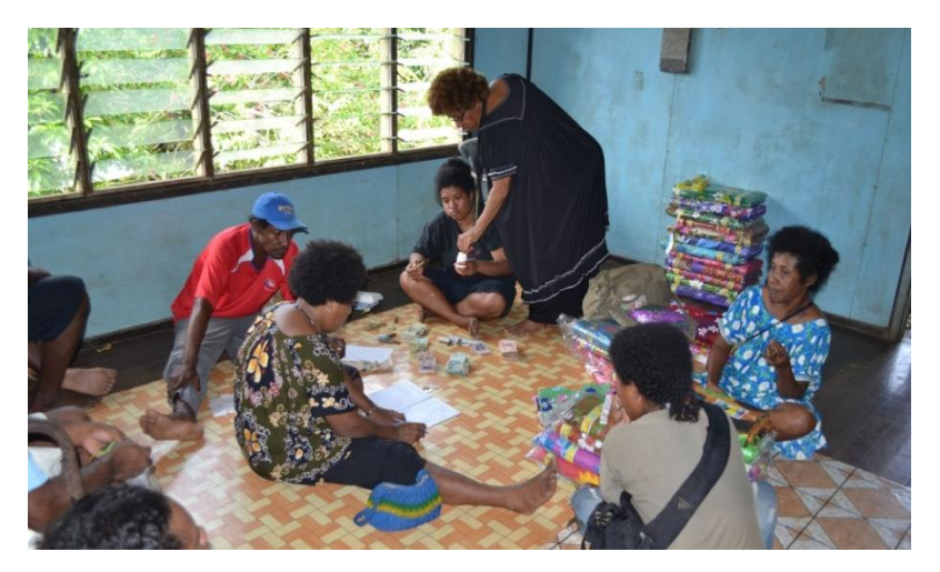
Figure 6: Redistributing the amounts of money and gifts collected from various groups at a pailou ceremony after a death