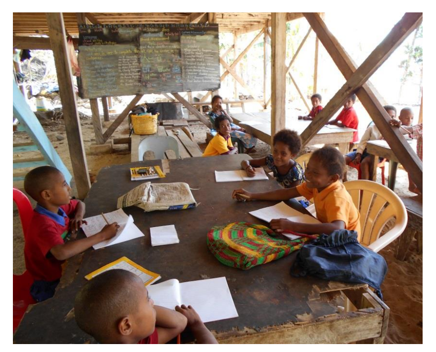
Figure 4: Pumbanin primary school