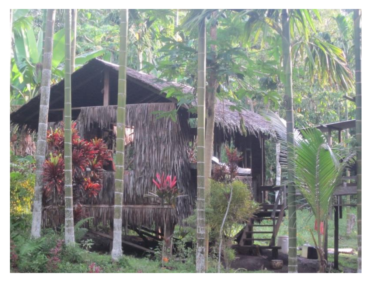
Figure 3: A kitchen building made from sago leaves