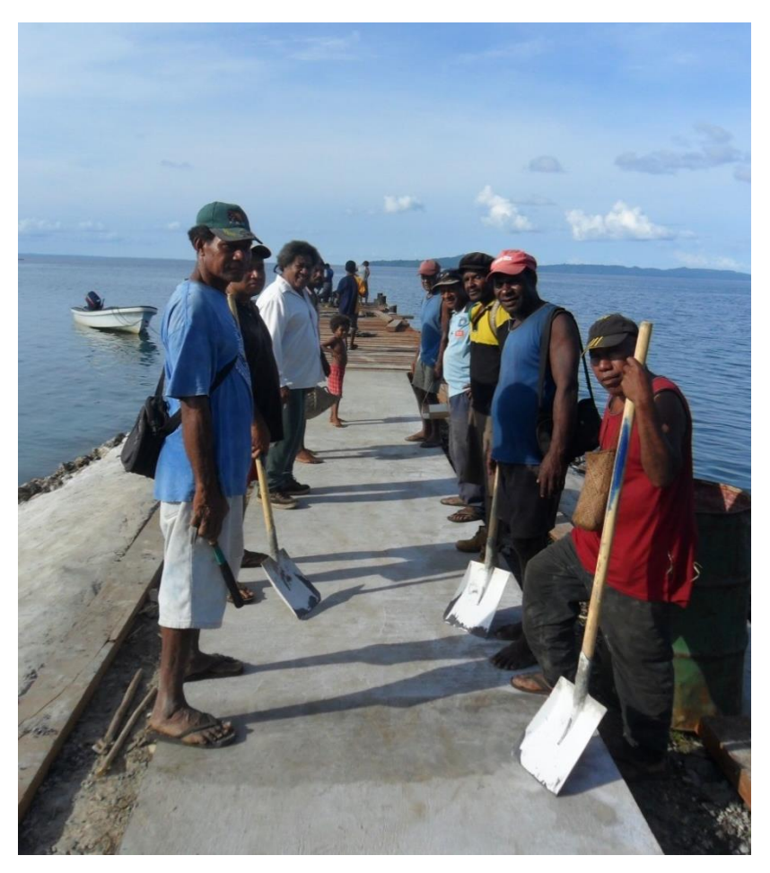
Figure 7: Communal work: building a new jetty

Paluai is an Oceanic language of Papua New Guinea that is vibrant and actively transmitted intergenerationally, unlike many indigenous languages of Papua New Guinea. Despite this, it is under threat from Tok Pisin and to a lesser extent English. Code-switching is pervasive, and the language has very little institutional support in the form of written materials, or systematic use in educational contexts. It shows signs of severe endangerment in domains where it is most closely linked to more traditional elements of the culture it is embedded in, such as the special register used for chanting, or the kinship terminology.