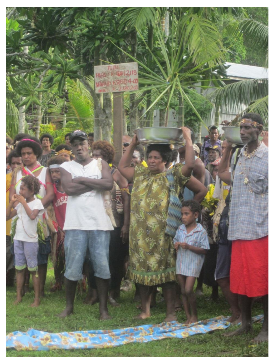
Figure 5: Sign making the announcement of the amounts of money collected from the father's and mother's side for a bride price