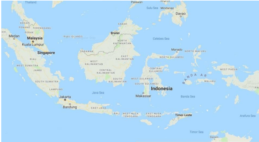
Map 1: The island of Sulawesi in western Indonesia (Google Maps 2018)