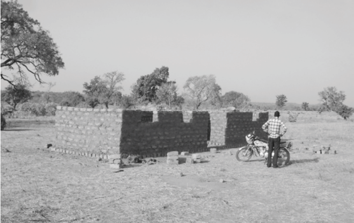
Figure 5: The half-finished Cicipu Language Project office (March 2011)

The most interesting thing about this dispute is the way in which it has been framed by the opponents of the building. After the first few attempts to stop construction failed, the nature of the complaint was changed to religious – it was claimed that the Cicipu Language Project was building a church. Not only were Muslim and Christian Cicipu working together in the face of this opposition, it was altogether remarkable, given the religious situation described in Section 3, to witness a Muslim Cicipu Language Project employee prepared to physically fight to protect a building denounced by its opponents as a church, and being dissuaded from doing so only by the arguments of a Christian Cicipu.