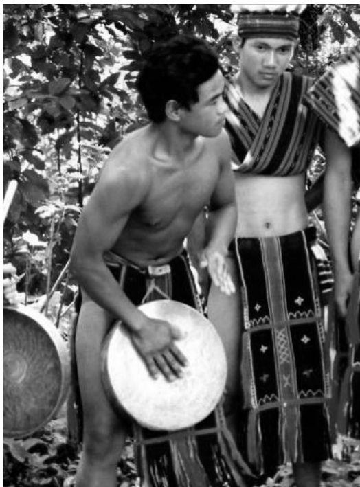
Figure 4: SLT Performance group in Kiangan