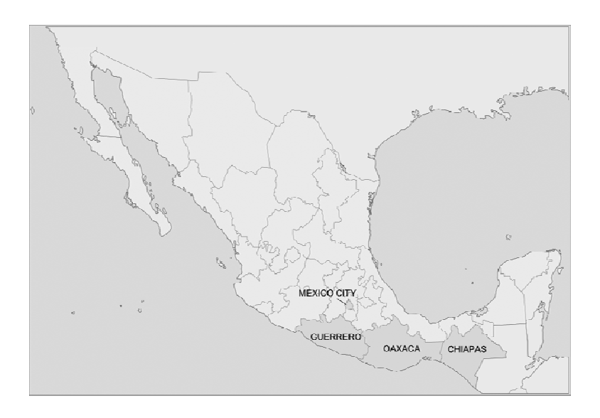
Figure 1: Map of Mexico. States referred to in this paper are highlighted.