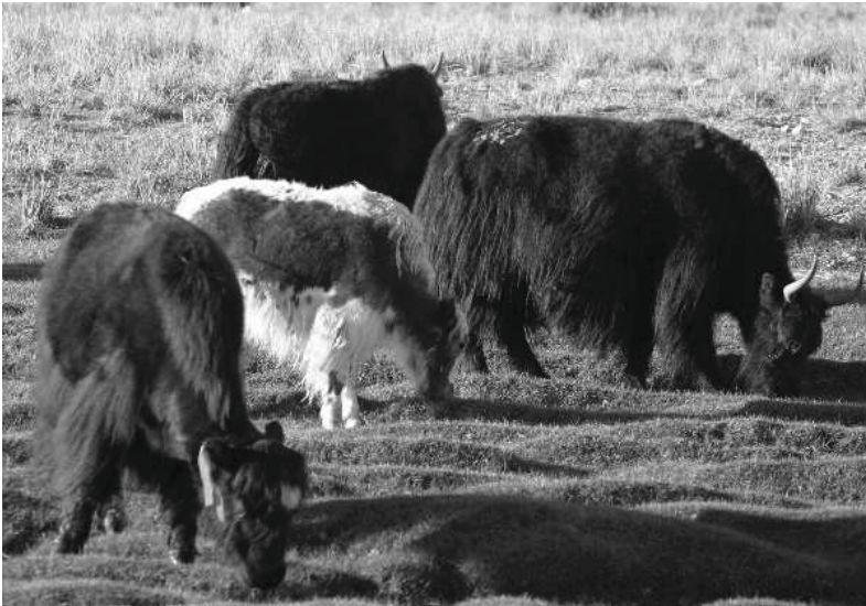
Fig. 4 Domesticated yaks in western Mongolia, 2004. The yak in the foreground cannot be considered ‘black’ because it has a small white head-spot. The yak on the right is black.

Tuvans thus employ a set of ‘emic’ categories that parse the visual color / pattern palette of animals, as culturally defined, into the lexicon. Blue, for example, is culturally more salient than black for Tuvans, and is learned earlier and used far more frequently, perhaps in part because it is a rare and prized yak and goat color. In the Berlin and Kay (1969, Kay 1975) hierarchy, black comes before blue in the order in which languages augment their color term repertoire. For Tuvan children, blue comes first. While it is beyond the scope of this paper to review the entire color perception literature, field linguists can profit from careful attention to the uses of color terms in their native environment while suspending any expectations of universality (Levinson 2000).